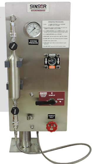
LGSS & VSS